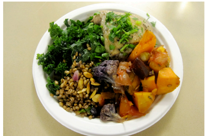
Is this what healthy eating looks like?