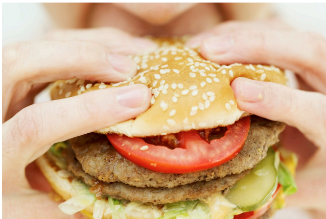
Why do we eat what we eat?

Display the Healthy Eating Plate slide and distribute the Blank Healthy Plate Handout . Ask for volunteers to briefly summarize the healthy plate model. Then instruct students to use this model to draw or describe a healthy lunch: a meal that provides your body with the nutrients it needs for growth, maintenance, and repair; supplies energy for daily activities; and reduces the risk of illness. Then ask volunteers to share their illustrations and encourage others to provide feedback. Ask: Is this meal complete? What is missing? What is excessive? What barriers prevent people from eating healthy meals?